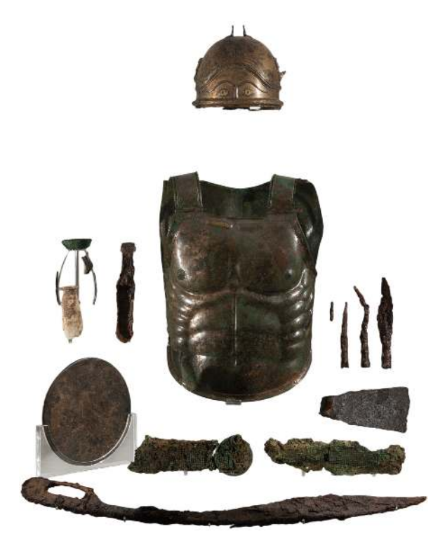
Fig. 1 Lanuvium, Funerary set of a warrior.

In conclusion, in ancient Italy the adoption of the Greek gymnasium was one of the most common tools for becoming Greek, in addition to the adoption of the language, the social behaviors and the material culture. In many cases, this phenomenon can also include the appropriation of the typical Greek institution connected with the paideia , such as the Gymnasium. The modalities and the aims, both political and cultural, that justified this choice varied and must be evaluated individually, as they depend on the contexts.