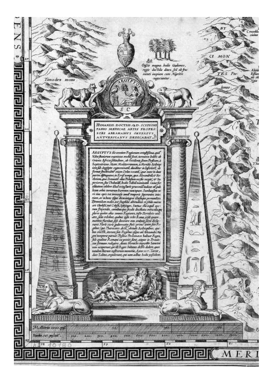
Fig. 1 Abraham Ortelius, Aegyptus, 1565.

did not mean a decrease in map production. On the contrary, maps of Egypt kept being published and improved with the help of second-hand sources. The persistent dynamics of the production can be explained by the translation of Ptolemy's Geography into Latin. The quickly printed translation of the Geography was accompanied by maps and stimulated a new way of mapping.<sup>36</sup>