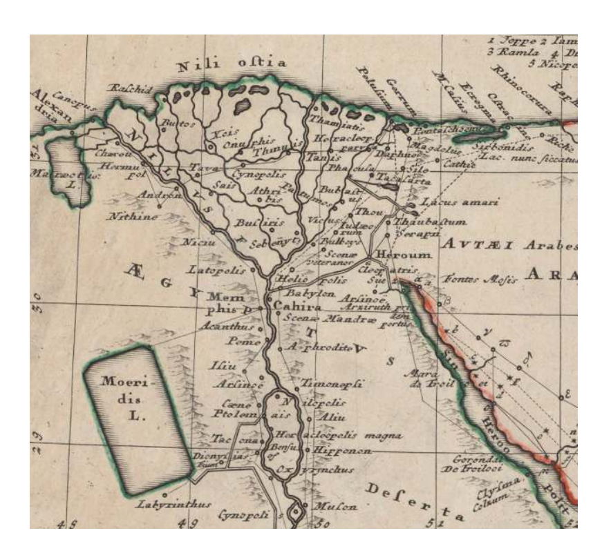
Fig. 5 Johann Matthias Haas, Typus aetiologicus I, II.

D'Anville's map of modern Egypt was brought to Egypt by Bonaparte in preparation for the French campaign in Egypt.<sup>68</sup> However, for the first publication of the Description de l'Égypte in around 1809, the Aegyptus antiqua by d'Anville was chosen to be printed with the book (Fig. 6), because Bonaparte used his veto and forbade the publishing of the modern map for military reasons.<sup>69</sup> The influence of d'Anville's map of ancient Egypt was long lasting and inspired the geographical work of Jean-François Champollion, a well-known scholar among Egyptologists. According to him, he was able to use the map of Upper Egypt as drawn by d'Anville without having to make any modifications.<sup>70</sup>