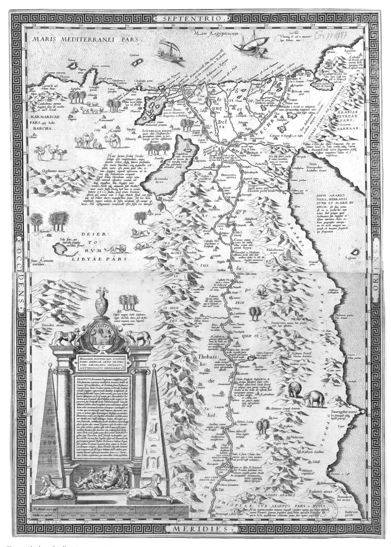
Fig. 4 Abraham Ortelius, Aegyptus, 1565.