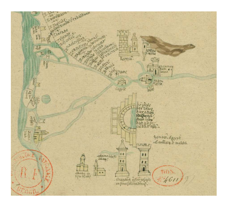
Fig. 2 Paulin de Venise, Mapa regnorum Syrie et Egypti, v. 1328.

of cartography and the art of making nautical charts, Ptolemy's Geography fundamentally renewed the construction or compilation of maps at the end of the 15th century. The new maps were not better than the previous ones. The appearance of mathematical maps must not necessarily be seen as an improvement. For instance, the outlines of continents and countries were described with less accuracy than in older nautical maps, which were much more detailed in this regard. This novel approach should be valued rather as a new way of integrating information in a codified space.<sup>37</sup>