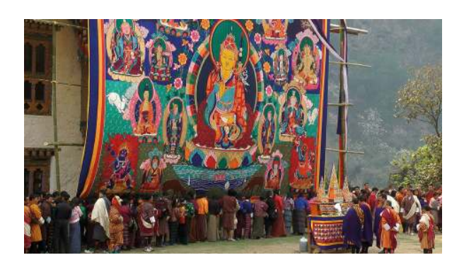
Fig. 7 Pilgrims receiving blessings from the large scroll image with Guru Rinpoche in the centre surrounded by his eight emanations.

congregation to Guru in front of an altar, accompanied by six 'sky-goer' dancers performing the Zheshi Pemo, the audience, patiently standing in line around the dance ground, was passing along and touching the hemline of this thangka that is called a ' thongdröl ', literally 'liberation through seeing', with their forehead in order to receive Guru's blessing (Fig. 7). The scroll also formed a beautiful backdrop for the ritual and folk dances performed in front of it.<sup>54</sup>