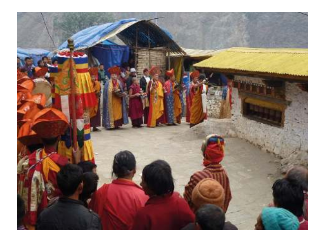
Fig. 6 The 'gold libation' rite (serkyem), an offering by the Trashigang monastic congegration on their circumambulation path around Guru Rinpoche's paradise rock.