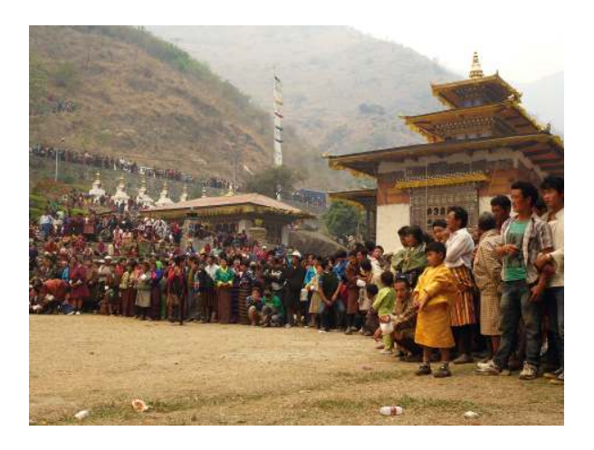
Fig. 9 Pilgrims as spectators.

However, the issue of 'safety, sanctity and dignity' is also of concern in relation to tourism. Clearly, the Bhutanese state seeks to ensure a low risk environment for high-paying foreign visitors via police presence and other management practices. The tourism department wants to increase tourist attractions, by providing "greater access to cultural and natural wealth, such as Dzongs, Tshechus, religious ceremonies, Neys, parks, rivers and mountains" but also, tourist development needs to "be facilitated with proper rules to ensure safety, sanctity and dignity of people and tourism resources." <sup>58</sup>