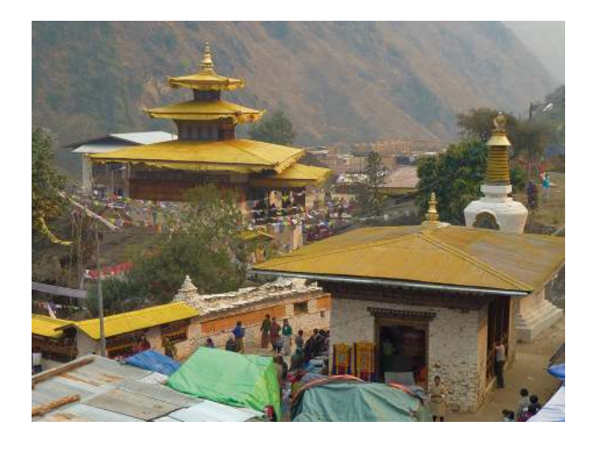
Fig. 4 Market stalls alongside the outer circumambulation path of Gomphu Kora.

yet all made available, becoming part of the lived realities at and around Gomphu Kora (Fig. 4).