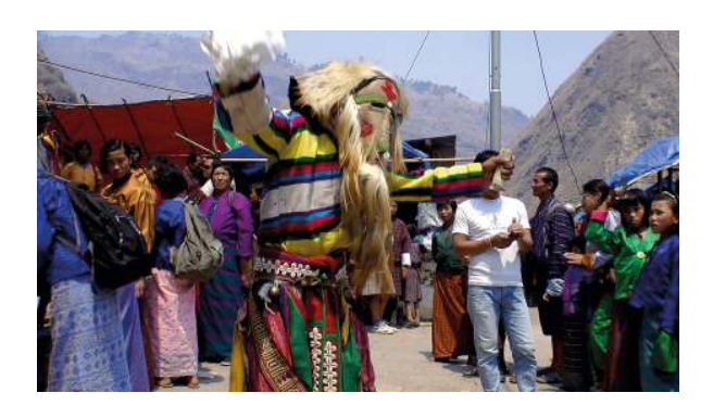
Fig. 2 A Dakpa dancer offers a 'good luck' dance for money.

compared with the past, I thought to myself, while watching everyone enjoying themselves happily with games and mass produced plastic consumer goods. Older pilgrims complain about this new type of commercialization of pilgrimage festivals.<sup>35</sup>