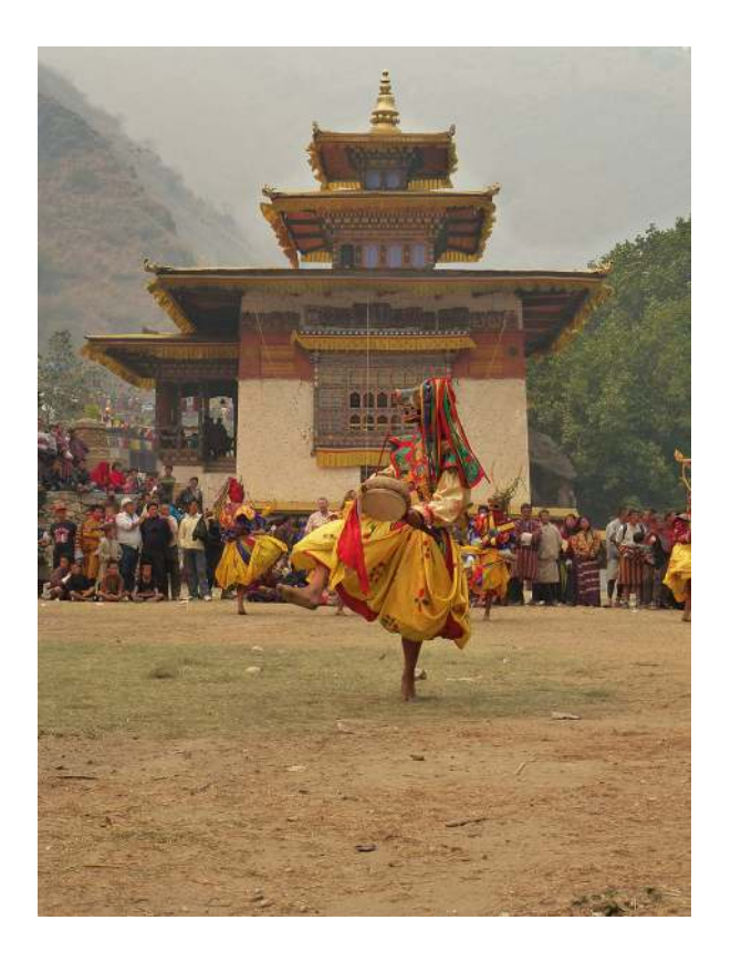
Fig. 8 Cham dancer in front of temple at Gomphu Kora Tshechu.

against demons, these are now more decorative adornments and at times are commented on with shyness by 'modern' Bhutanese. Nevertheless, it also seems that this topic was absorbed in some of the tantric powers attributed to the great tantric masters. Therefore, it might be no surprise to find popular fertility temples in Bhutan. As we have seen, at the temple in Gomphu Kora, Guru Rinpoche's 'phallus' is kept among the 'treasure' relics in a glass vitrine. Cham performances in Bhutan are also famous for their characteristic interpretation of the well-known figure of the Atsara,<sup>57</sup> a type of clown endowed with a big nose (an Indian feature as is claimed) and a big red wooden phallus. As part of the ritual masked dance performances, he loves to entertain the crowd with chasing after women, making fun of dignitaries or tourist cameras.