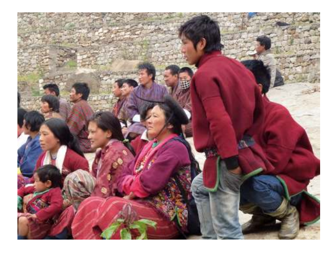
Fig. 3 Group of semi-nomadic Brokké-speakers.