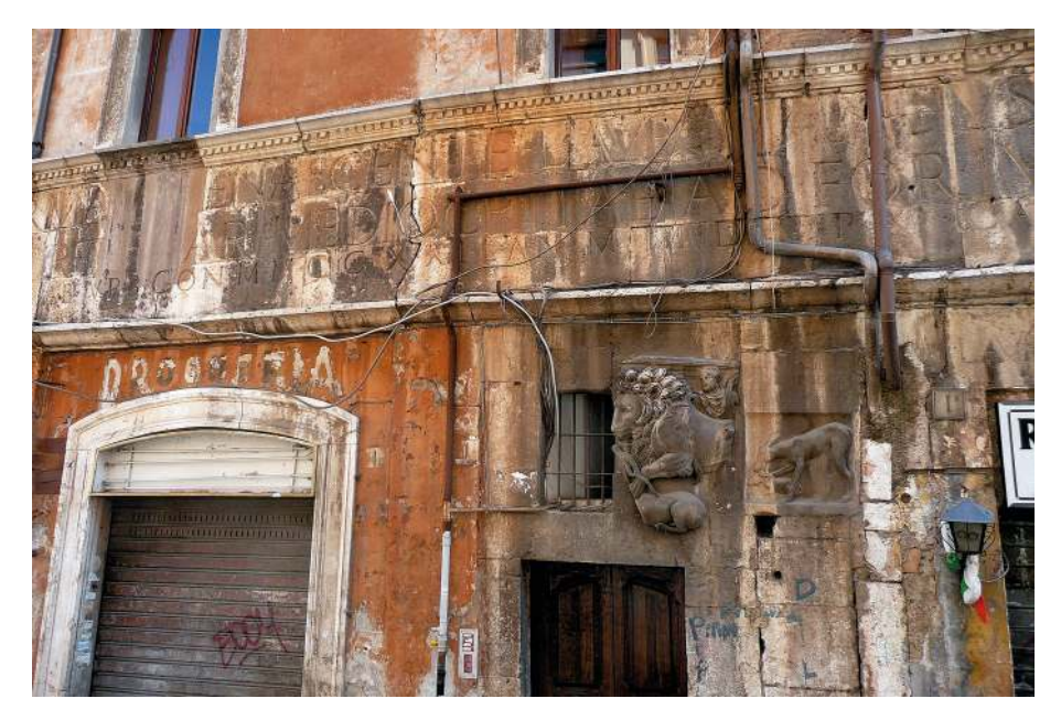
Fig. 1 Spolia in the wall of Lorenzo Manlio's house, with the extensive new inscription above.

togate statue which he entitled VALER PUBL CC (Valerius Publicola, consul more than once), and a fragment of a relief showing the fasces. Santacroce was a prominent civic dignitary at Rome, holding the positions of maestro delle strade in 1449–1450 and conservator in 1466; on a basic level, these images and textual references to Roman magistracy seem to have been designed to convey his authority (in the façade of one of the residences of the della Valle family, great political rivals to the Santacroce, was a ancient relief described as showing 'a shrouded man holding a book, with two cocks on each side,' which seems similarly designed to convey power). More specifically, Andrea seems to have decided that Valerius Publicola, one of the four Roman consuls legendarily responsible for overthrowing the monarchy, was an ancestor of the Santacroce family. Like Manlio, therefore, Santacroce identified his family with a known Roman Republican hero.