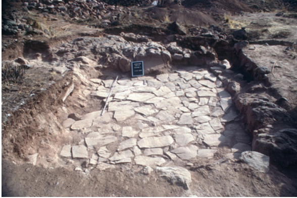
Fig. 3 Upright stone monolith surrounded by low stone wall at site of Q'enko located above and outside the city of Cuzco.