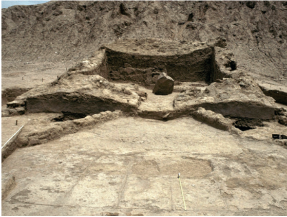
Fig. 5 Temple of the Sacred Stone at the site of Tucume on the north coast of Peru.

Further to the north, at the important late period site of Tucume on the Peruvian coast, excavators uncovered a small structure with a large, deeply embedded monolith in the center (Fig. 5). The building was subsequently designated the Temple of the Sacred Stone. Numerous offerings were found in pits located directly below and in front of the stone huaca consisting principally of spondylus shell and miniature representations of objects such as pottery vessels, corn, plants, birds, fish, jewelry, tools, and musical instruments all produced in sheet metal. 38 The researchers describe in particular a series of miniature metal vessels consisting of a double-spout and bridge bottle, a high neck jar, and two plates. Such items, I would suggest, could all be construed as accoutrements of ritual feasting rendered particularly fit for an extraordinary personage through their miniaturization and their production in precious metal.