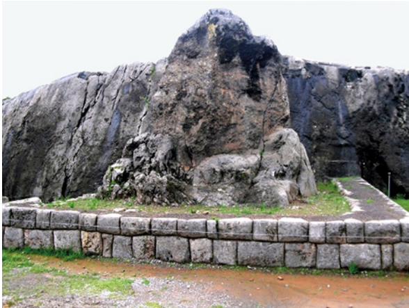
Fig. 4 Upright stone monolith surrounded by low stone wall at site of Q'enko located above and outside the city of Cuzco.

In other parts of the Andes, upright monoliths, sometimes demarcated by stone platforms or other enclosures, were also clearly recognized as huacas (Fig. 4). Various such monoliths located throughout the Callejon de Huaylas region of the central highlands of Peru are identified still today by local communities as sacred sites. In a recent survey of the region, limited test excavations were conducted adjacent to one of these monoliths. 36 The 1 \times 2 meter excavation unit reportedly produced dense quantities of undecorated domestic pottery, together with camelid, deer, and cuy (guinea pig) bones. These materials were interpreted as evidence of large-scale feasting carried out in direct association with the huaca . 37